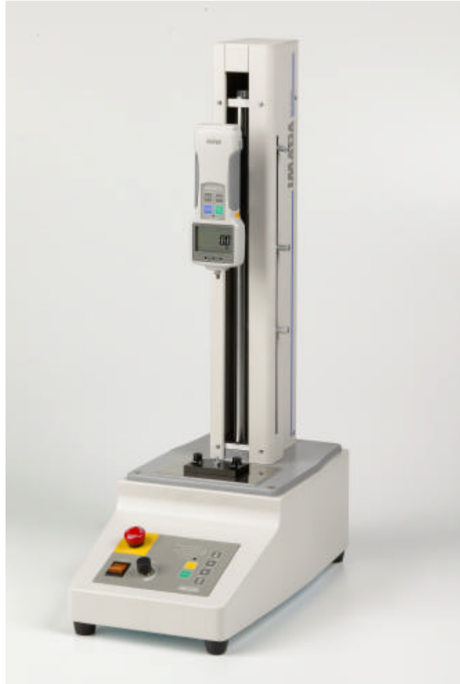
MX-2000N (Force gauges are sold separately.)