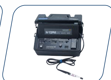
H10PM Refrigerant Leak Detector