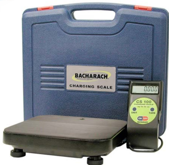
Model CS100 2010-0000