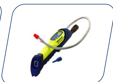
Informant 2 Dual Purpose Leak Detector