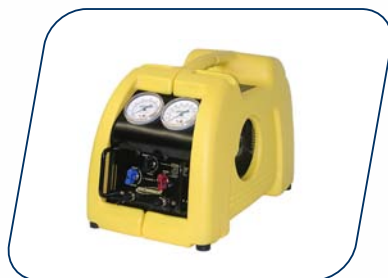
Stinger Refrigerant Recovery Unit