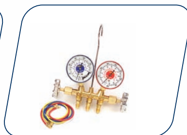
R-410A Manifold Set