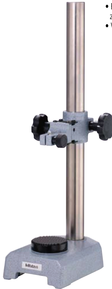
519-109-10 with \varnothing 58 mm serrated anvil